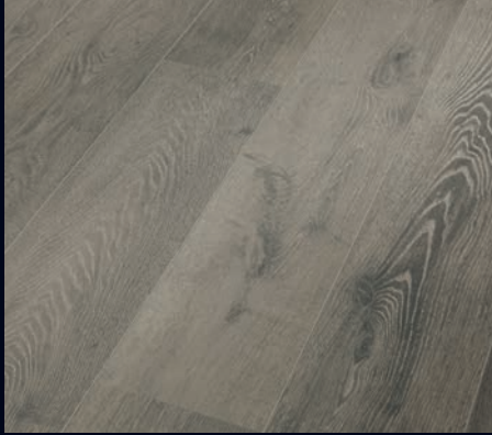
Grey oak 6132 | Wood effect