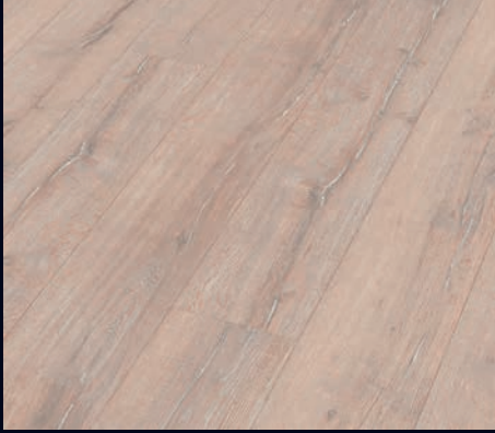
Midsummer oak 6864 | Wood effect