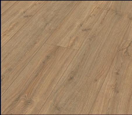
Nova oak 6413 | Wood effect