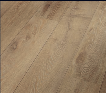
Medium oak 6131 | Wood effect