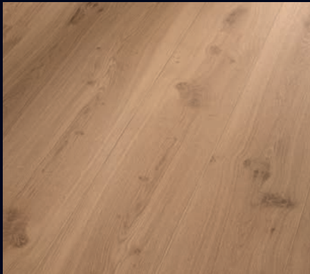
Natural oak 287 | Wood effect