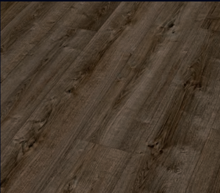
Dark farmer's oak 6834 | Wood effect