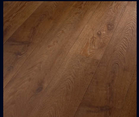
Brown oak 6036 | Wood effect