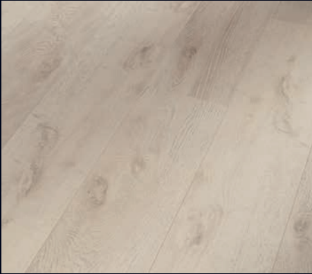
Arctic white oak 6503 | Wood effect