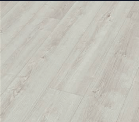
Iceland oak 6835 | Wood effect