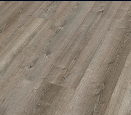
Greige farmer's oak 6833 | Wood effect