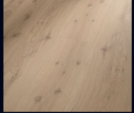
Light oak 286 | Wood effect