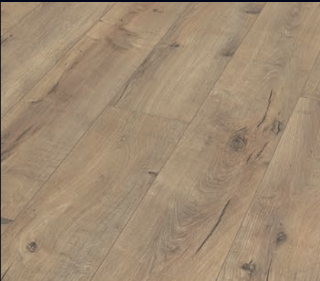
Cracked Terra oak 6439 | Wood effect