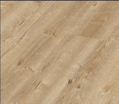
Light farm oak 6831 | Wood effect