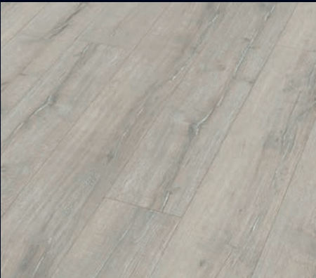
Grey white midsummer oak 6868 | Wood effect